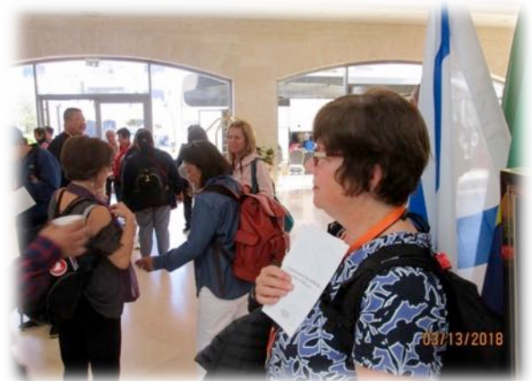
At the Hotel Nazareth. Getting ready to leave for Cana.