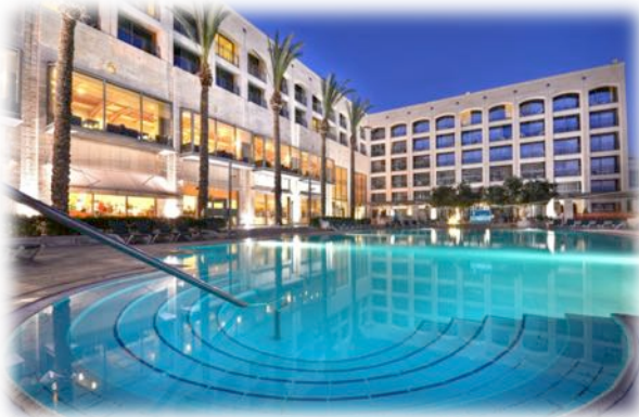
The Golden Crown Hotel in Nazareth, Israel

We spent the first three days of our seven-day trek in northern Israel, that is, in the region of Nazareth. The Golden Crown Hotel was our base of operations. It made sense logistically that we visited holy sites in a way that utilized our time most efficiently. So on our first day of travel we visited the Mount of Precipice, the Wedding Church in Cana, the Mount of Transfiguration, the Church of the Annunciation, and Saint Joseph Church. The events that transpired at these locations occurred at various times during the earthly life of our Lord. I have decided to arrange this journal so that we are following the footsteps of our Lord starting with the birth and early life of His Mother, Mary, to His accession (and His return in glory).